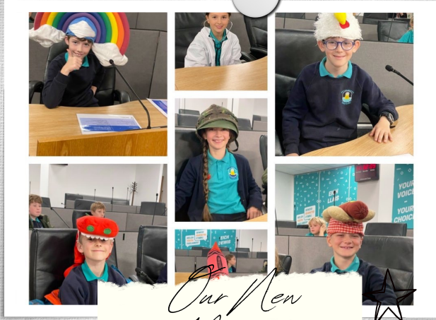
Our New Ministers