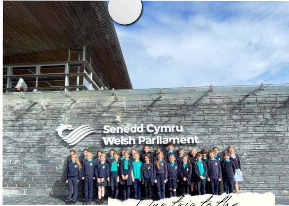
Our trip to the Senedd