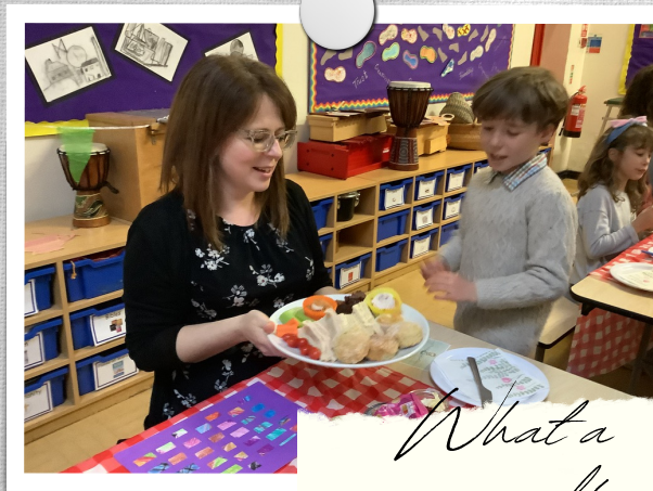
What a spread!

Our literacy focus has taken us through texts where we have written a diary entry as a prehistoric child, a prequel imagining we would live forever and rhyming couplets poetry about disasters befalling small children!