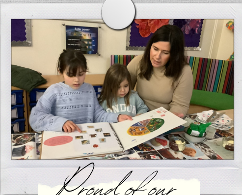
Proud of our learning