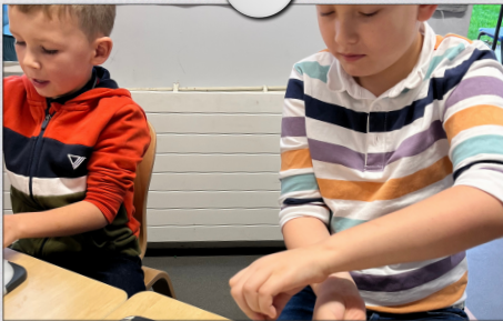
How many do we need to make?