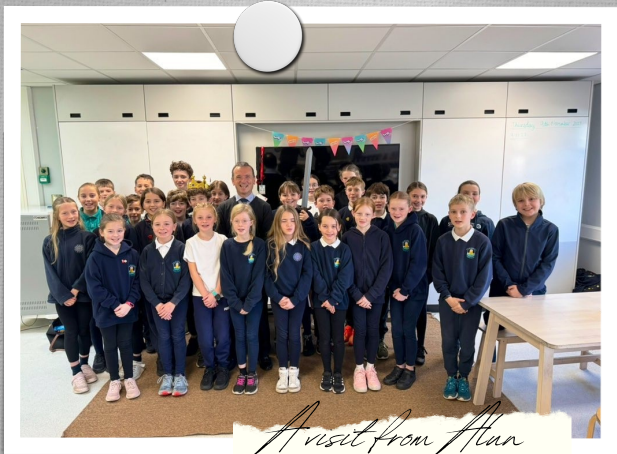
A visit from Alun Cairns