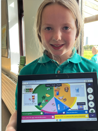
A balanced meal