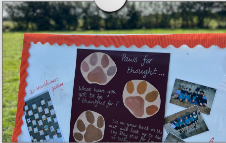
Paws for Thought