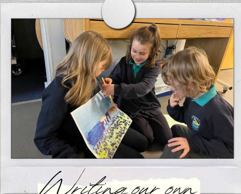
Writing our own puppet shows