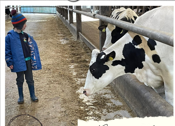
Down on the farm