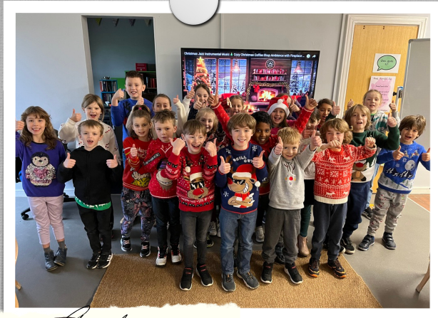
Christmas jumper day