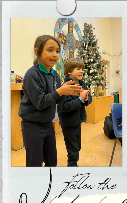
Follow the leader, clap the beat