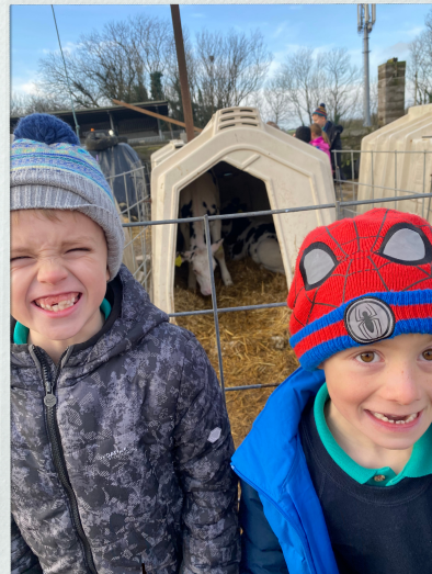
Gaps, guns and calves!