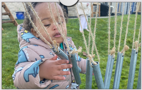
Ding Dong went the chimes!

A huge thank you to all of you for providing such beautiful costumes for 'The Twinkly Nativity'.