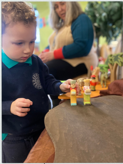
The wise man brought gold.