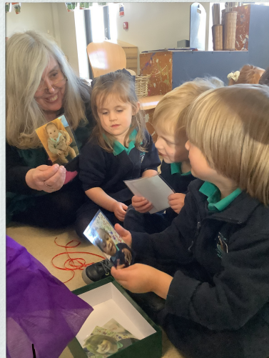
We were all babies!