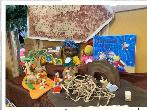
Setting up the Nativity story.