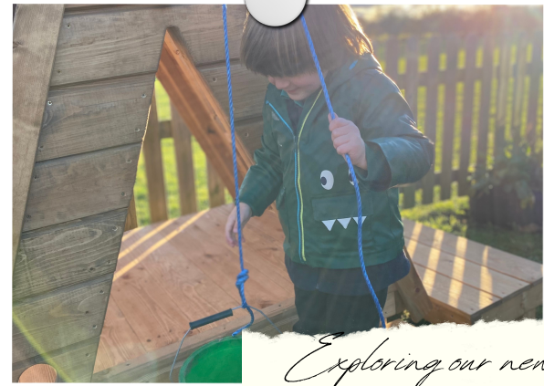
Exploring our new teepee!

They all shone so brightly. We were very proud of all of your wonderful children.