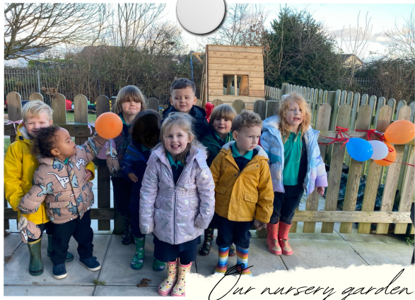
Our nursery garden is now open!