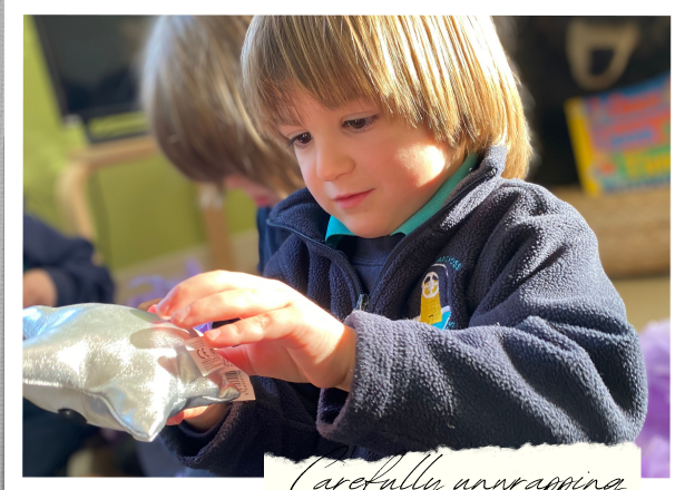
Carefully unwrapping our presents.