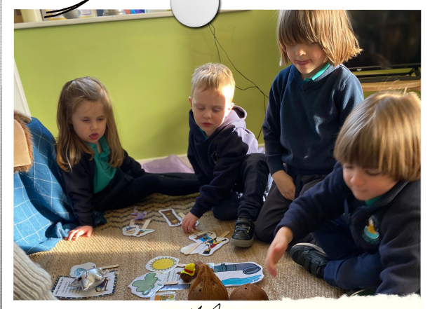
Matching items to the nursery rhymes.