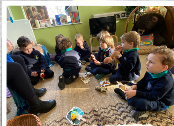
Playing 'pass the parcel'.

What an amazing and exciting start we've had to our new year in Dosbarth Padarn! We are all happy and have settled in very quickly and welcomed our new friends to our fantastic class.