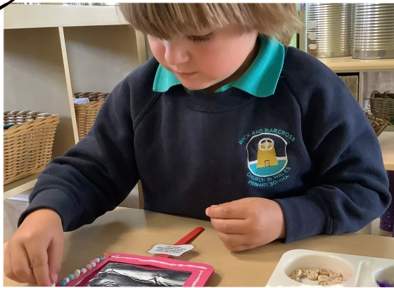
Just how special God made me...