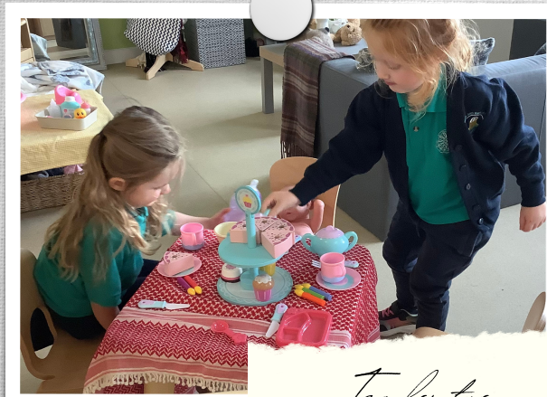
Tea for two

We have continued our inquiry 'Pwy ydw I?'. We have enjoyed learning more about ourselves and each other. We have learnt about our 'Christian Values' and talked about being kind, caring etc. We've even created our own mirrors 'I look in the mirror and what do I see? Just how special God made me!' We have decorated them from a choice of resources and are very proud of them, hanging up in our classroom.