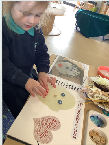
I am caring