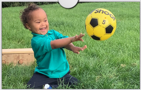
What a shot!