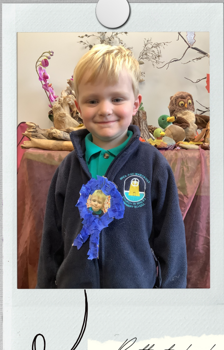
Rosettes to show how special we all are.

We have continued our inquiry 'Pwy ydw i?' We've learnt more about our families and have talked about them to each other. We hve enjoyed learning about our senses and made 'popcorn'. We learnt that we can see, smell, taste, touch, and hear the 'popcorn'. It smelt and tasted so yummy. We've had so much fun learning about our feelings and emotions. We had so much joy and laughter, taking turns, looking into the mirror, showing different emotions on our faces.