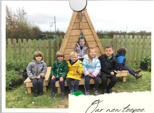
Our new teepee.

We have also been thrilled to start to develop our nursery garden with all of our new equipment. We would also like to say a big thank you to the parents that have helped us to create this very special place.