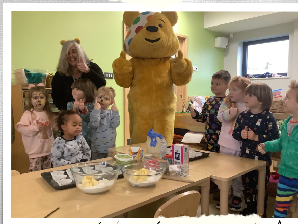
We had a very special visitor