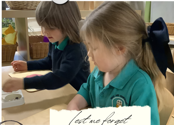
Lest we forget