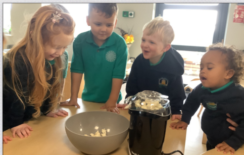
Pop went the popcorn