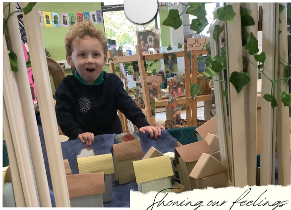
Showing our feelings in the mirror!