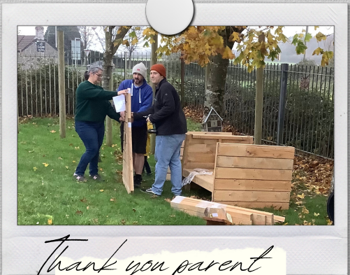
Thank you parent helpers!

We know you enjoyed sharing our learning during the autumn term with our wonderful pictures on our very own i movie celebrating ourselves.